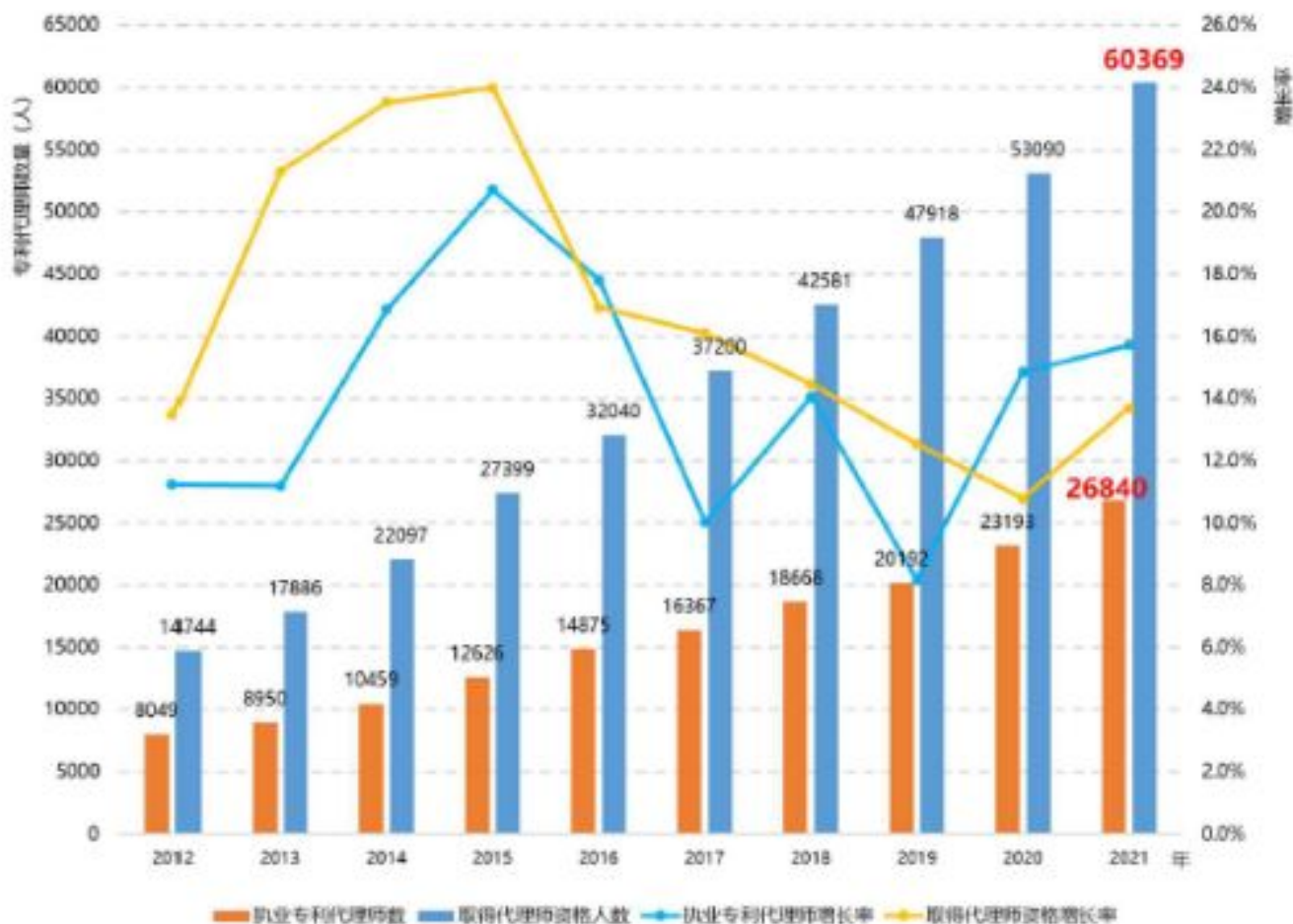
图 2 2012-2021 年执业专利代理师及取得专利代理师资格人数变化情况

By the end of 2021, a total of 60,369 people have obtained patent agent qualification certificates, with an annual growth rate of 13.7%. There were 26,840 practicing patent agents (those that have completed all requirements after receiving certificates) by the end of 2021. This means that each patent agent has filed an impressive 73.5 patent applications (invention and utility model) in 2021 on average as there was a total of over 4.4 million patent applications filed in 2021 per CNIPA .