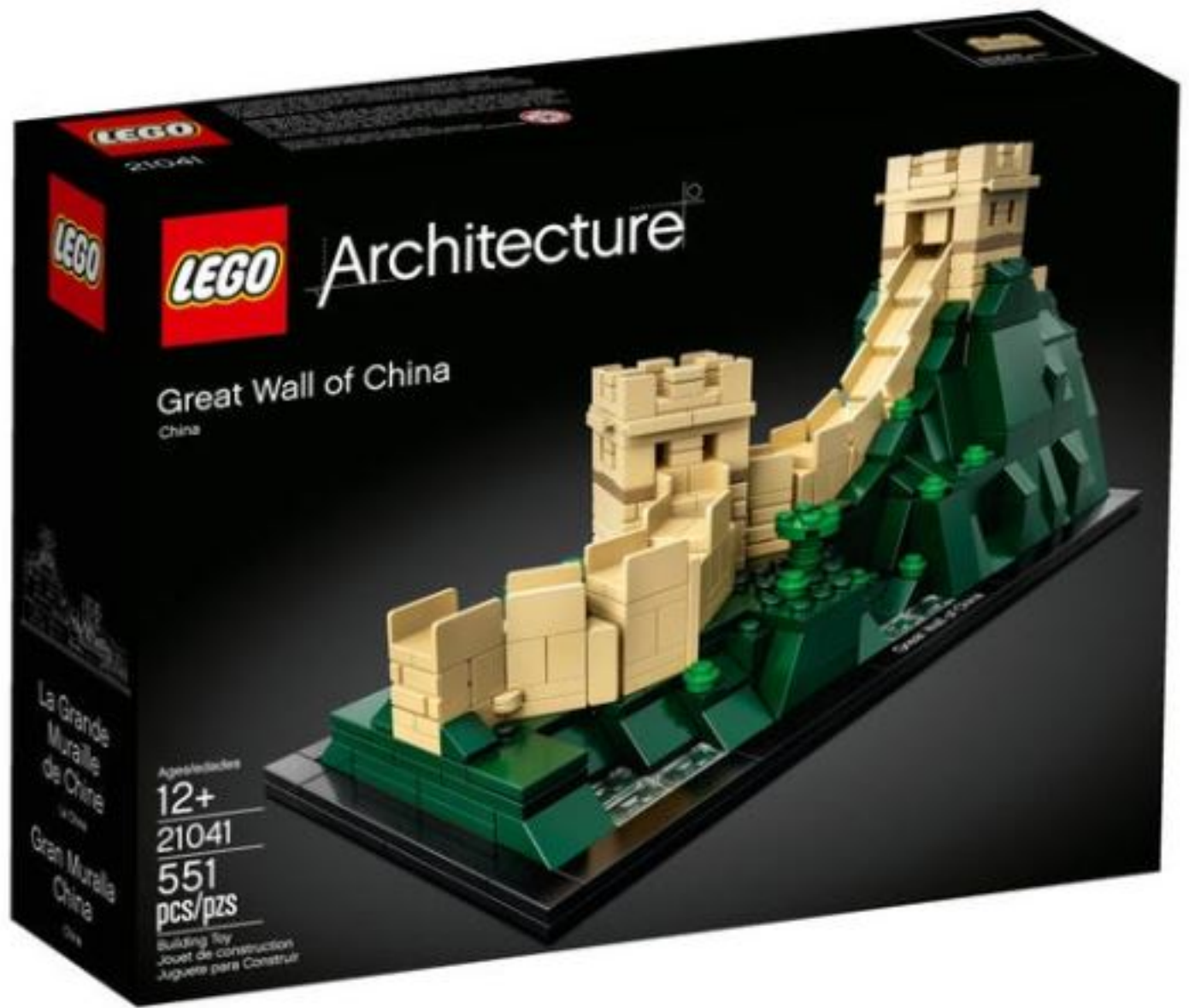
Lego Great Wall of China